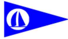
WOMENS' SAILING ASSOCIATION

4.2. The scheduled time of the warning signal for the first race each day is 1155 hours.