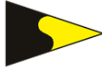
SOUTH BAY YACHT RACING CLUB