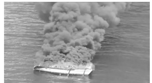
Green Dragon caught on fire!

The annual WOW / WAH race weekend, for all our female sailors and mixed crews, on Sept 18 & 20 th should not be missed – great competition and a great party weekend!